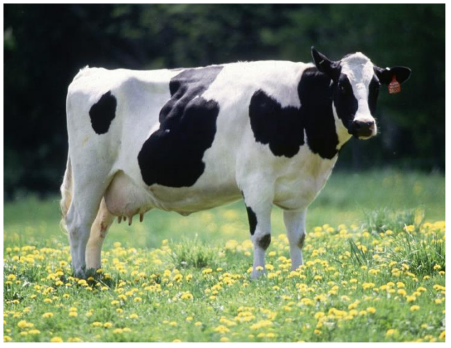
Holy Cow Committee Results